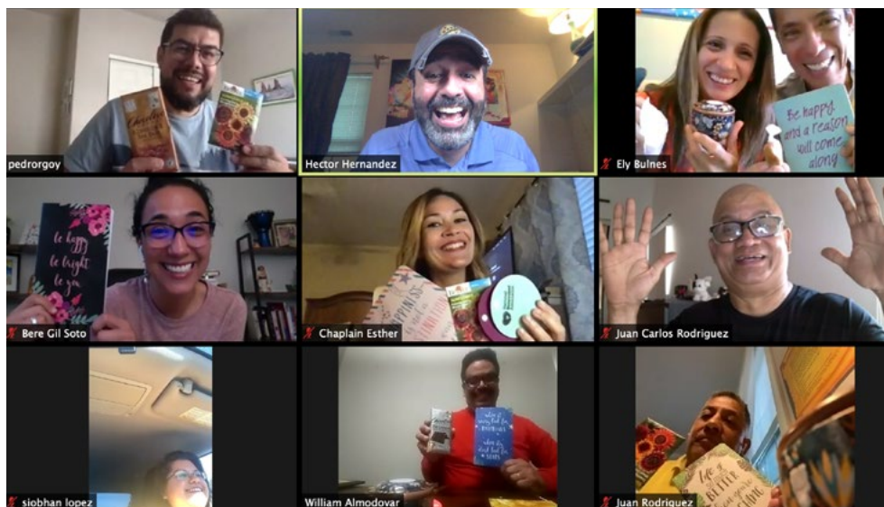
The 2020-2022 Multilingual Latin@ Pastors and Leaders group on a Zoom call.

This unique group is comprised of clergy who are serving Spanish speaking and/or multilingual Disciples churches. Many are bi-vocational, often serving in more than one multilinguistic (Spanish, Spanglish, English, and French) and multicultural community settings across the U.S. and Canada. They come from diverse cultural backgrounds and places of origin such as Venezuela,