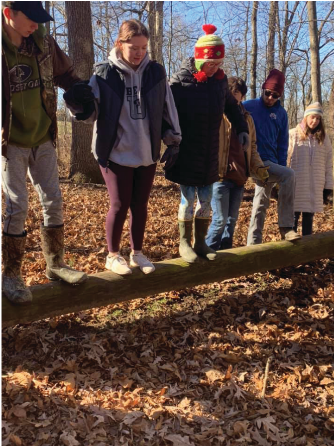
FCC Princeton's Venturing Crew experienced a ropes course as part of a leadership development retreat.